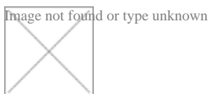
Figure 3: Debt Ultimately on an Upward Trajectory

The trajectory direction and the magnitude of the current debt outstanding is ultimately the most telling characteristic of the U.S. fiscal path. The widely acknowledged drivers of the long-term debt, health, and retirement programs for aging populations, and borrowing costs, will begin to overtake higher than average tax revenue and steady economic growth by the middle of the decade, and grow ever inexorably upwards until creditors effectively refuse to continue to finance our deficits by charging ever higher interest payments on an increasingly large debt portfolio.