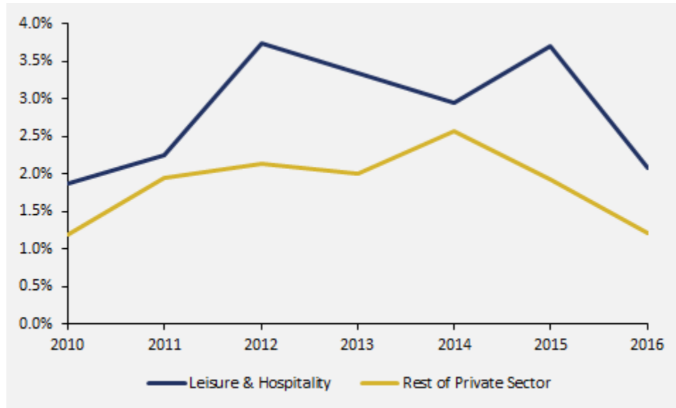
Chart 1: Job Growth in Leisure and Hospitality and the Rest of the Private Sector [7]

Since 2010, job growth in leisure and hospitality has far outpaced the rest of private sector. Employment in leisure and hospitality has grown at a 3 percent compounded annual rate between December 2010 and December 2016. At the end of 2016, leisure and hospitality had 15.4 million workers, 5.2 million of whom were in franchises. Employment in the rest of the private sector meanwhile has only grown at a 2 percent annual rate.