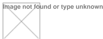
Chart 4. Six-Year Outcomes by Starting Institution Type