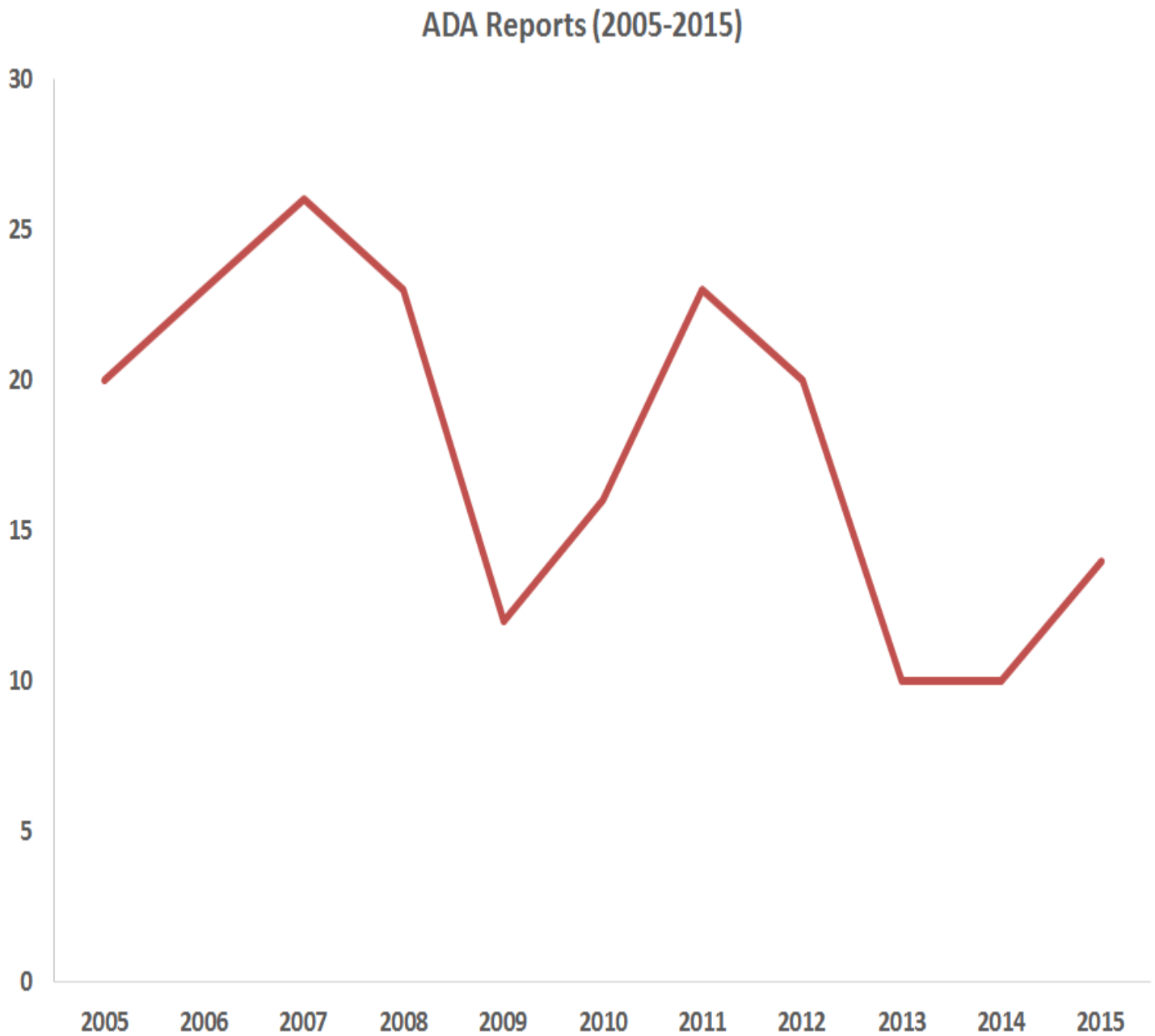
Figure 2: ADA Violation Reports

Over the same period, over $9.66 billion in federal funds were spent or obligated in violation of the ADA. [15] Note that a single report may include multiple violations of the ADA statute. Moreover, some of the funds reported in violation may be recorded in more than one report over more than one year. [16]