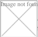
Image not found or type unknown As insurance premiums increase, the federal subsidies will remain relatively constant until 2019 when they will begin to decrease, shifting the burden onto exchange enrollees. The chart above illustrates premium support the relative contribution of the federal exchange subsidy to the insurance premium for a family earning 225 percent of the federal poverty level and enrolled in a Silver plan.